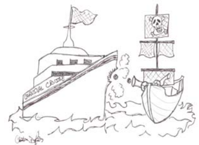
Illustration by Christian

"We're always looking for adventure, but this is probably a little more than we would normally look for," explained a Canadian passenger to CNN at the end of the eventful day.